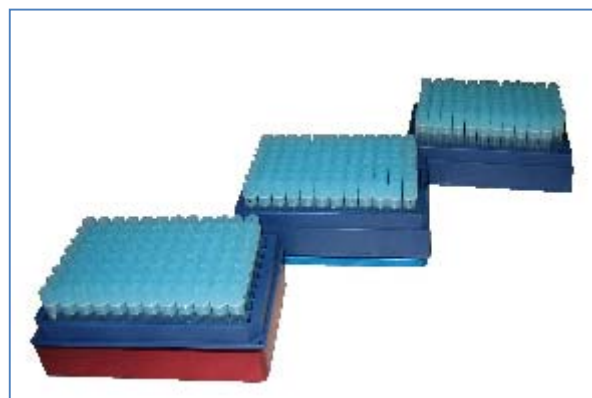
Special spacer: Applicable for short and middle size tubes