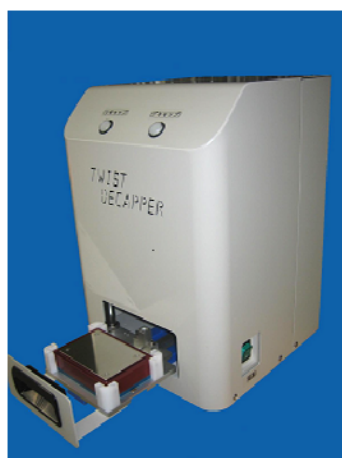
Stand Alone Type for manual operation TD-96 (48)

Adjustable for various types of transporting & pipetting systems