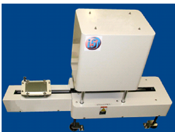
Integration Type for pipetting devices TD-96R (48)